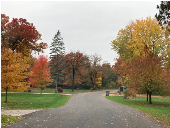
Repaved Kern Drive