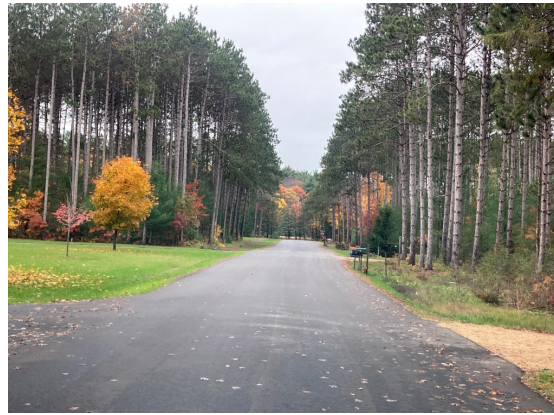
Repaved S. Hubbard Drive