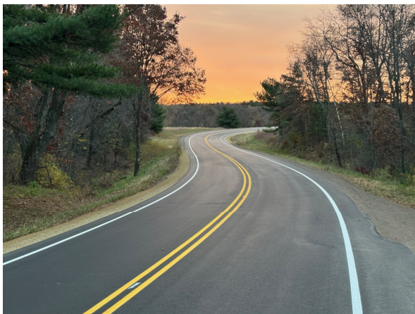
New Hobbs Road