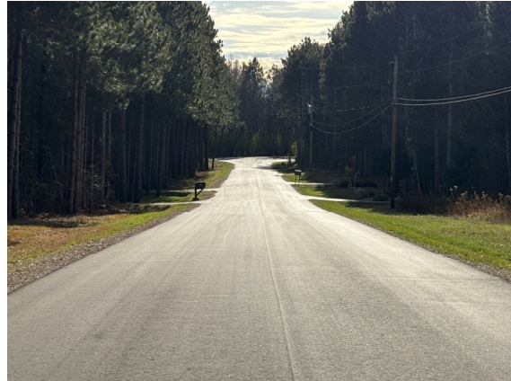
New Pinewood Road