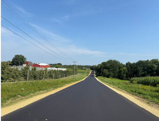
New Balsam Road

Whitetail Dr, Voight Rd, and Hillview Rd